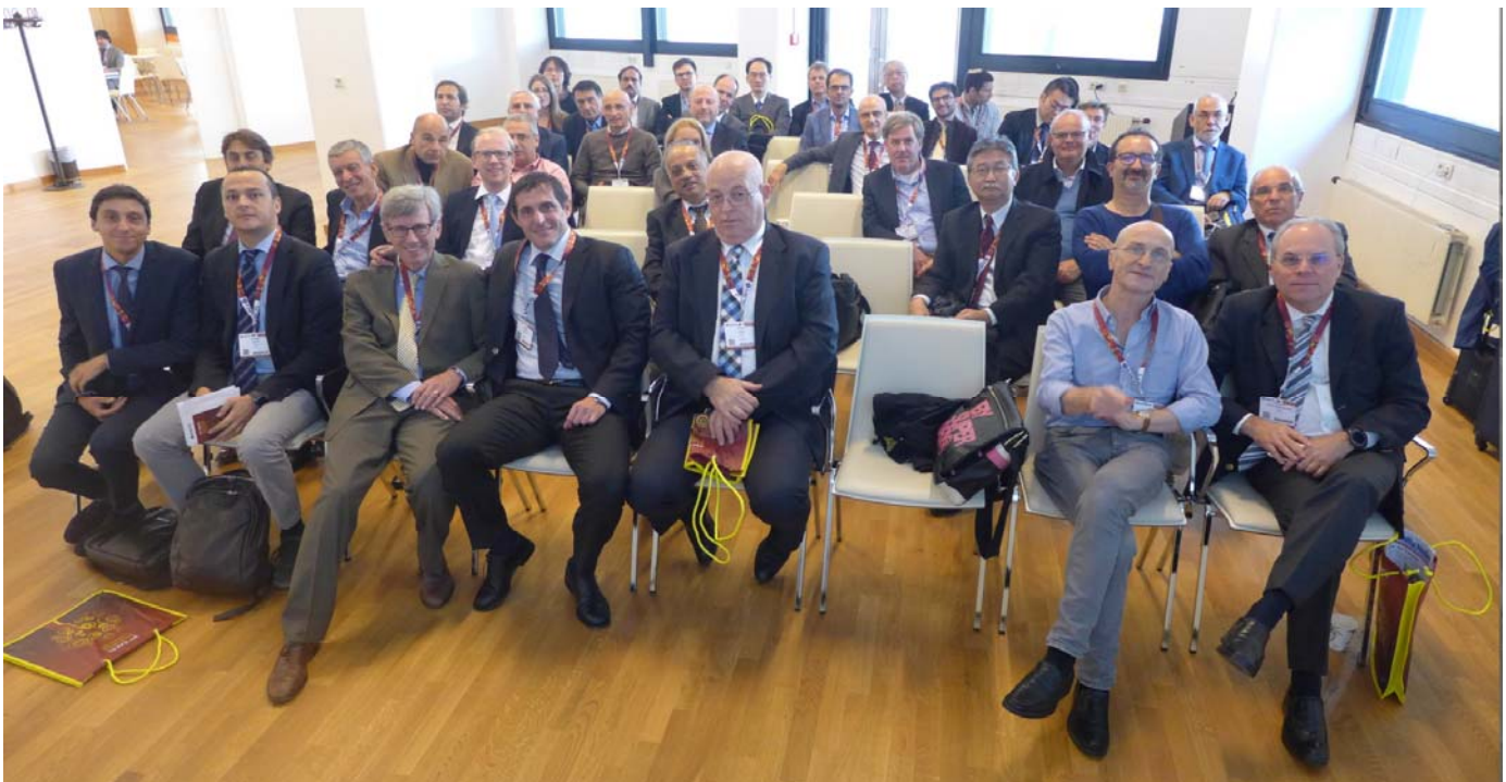
ROMA Investigator Meeting, Vienna