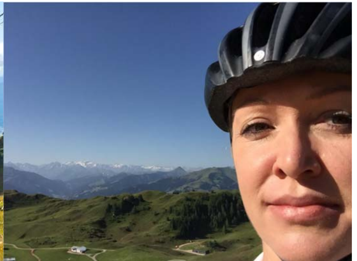
You can take the cable car, you can hike up, or you can bike up to the top. I prefer the last !!!!!