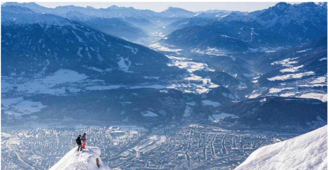
The winter view down to Innsbruck from our "North chain" mountains. Just 40 km away from the Italian border.