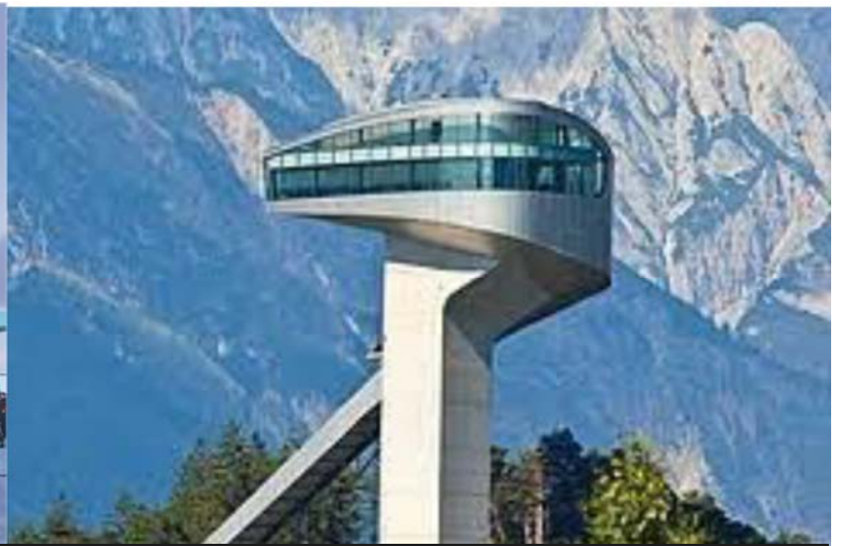
World famous architecture too (Zahra Hadid)