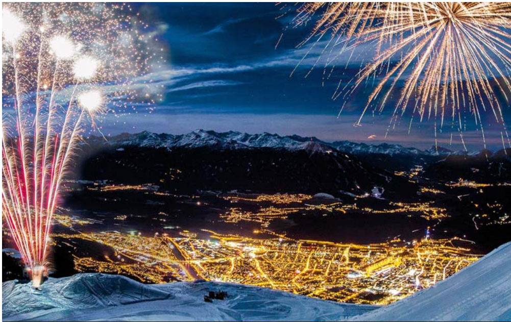
Happy new year from our "Times Square"