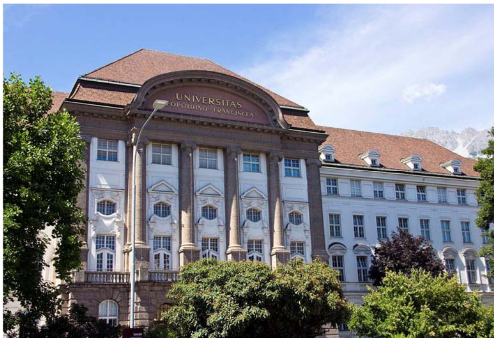
Old University building. We are celebrating 350 years in 2019!!!!